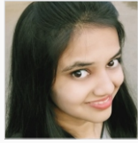
ITISHA JI A.D. OBC