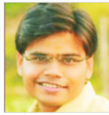
BRATESH JI BDO