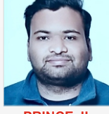
PRINCE JI CTI